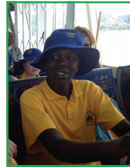
Guot enjoying a trip on the ferry.

The students have also enjoyed conducting a number of science investigations including testing paper helicopters and finding out how to make a toy car travel further.