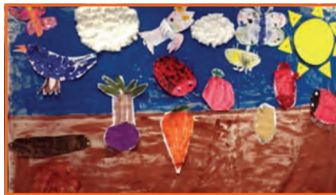
Our finished Art Mural.